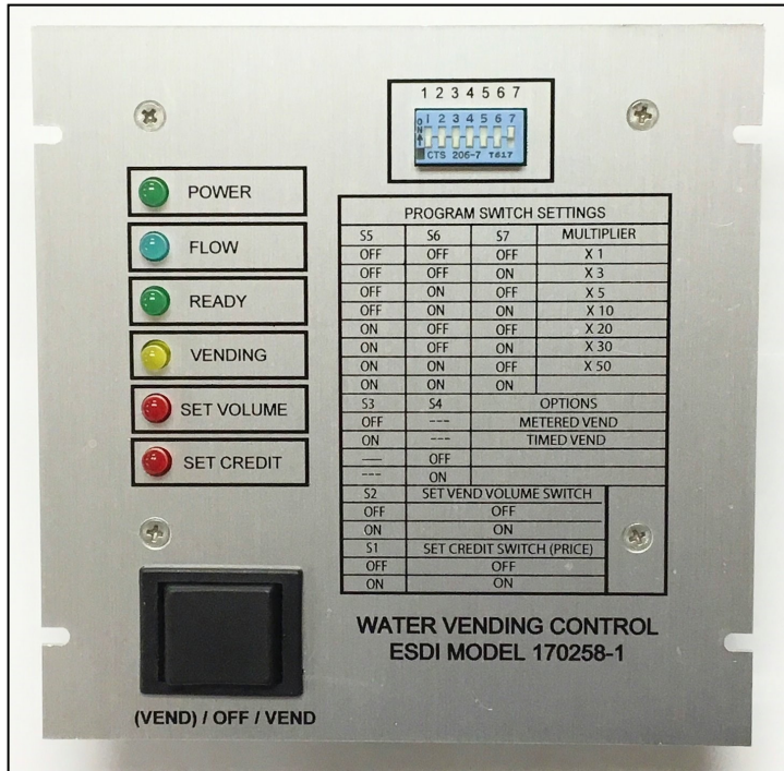
With Panel & Switch:

Single Price, Single Volume, Vends 1 Liter Up To 500 Gallons Timed, or Metered Vending, Multiple Credit Pulses